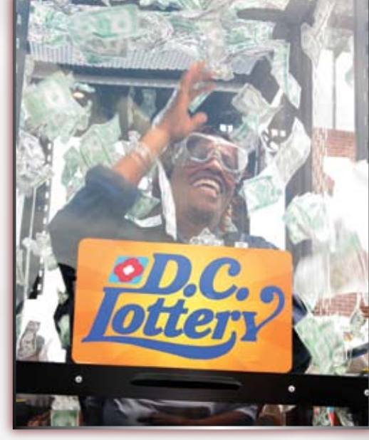
Venice Parker Money Machine