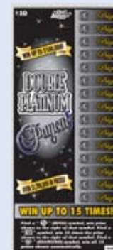
#594 - $10.00 "Double Platinum" 30 tickets per pack