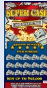
#578 - $5.00 "Super Cash" 40 tickets per pack