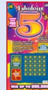
#577 - $5.00 "Fabulous 5's" 40 tickets per pack