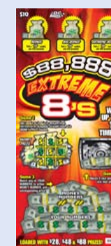
#601 - $10.00 "Extreme 8's" 30 tickets per pack