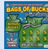
#596 - $2.00 "Bags of Money" 100 tickets per pack