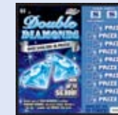
#595 - $2.00 "Double Diamonds" 100 tickets per pack