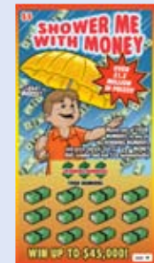
#566 - $5.00 "Shower Me With Money" 40 tickets per pack